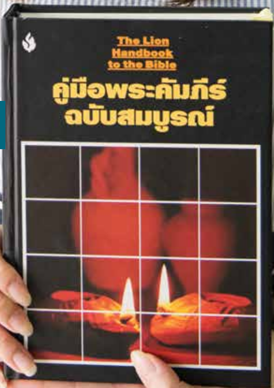
Sirikul Narin , editor at a Langham-supported publisher in Thailand